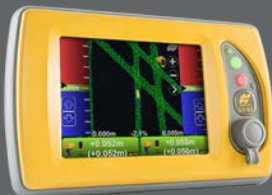
GX-60 Control Box