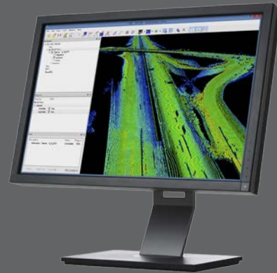
MAGNET Office with Resurfacing