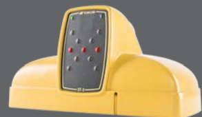
ST-3 Sonic Tracker