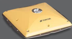
PG-S3 GNSS Antenna