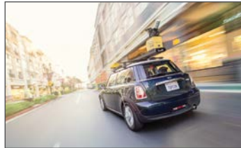
Mobile Module For IP-S scanner