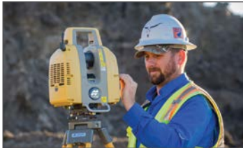
Scan Module for GLS-2000