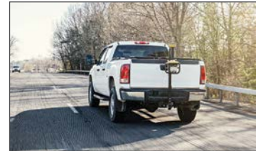
RD-M1 Module Road surface scanning